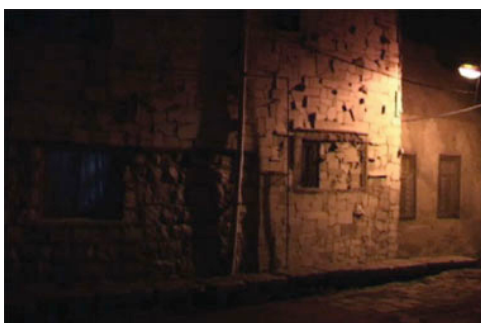
Yaron Lapid: Night meter video still; courtesy Angie Halliday

Slavka Sverakova is a freelance writer on art.